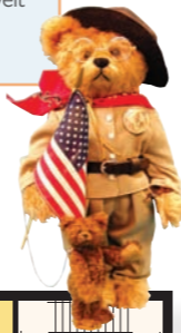
Room 36 Teddy bears were named after President Teddy Roosevelt and became popular in the early 20th century.