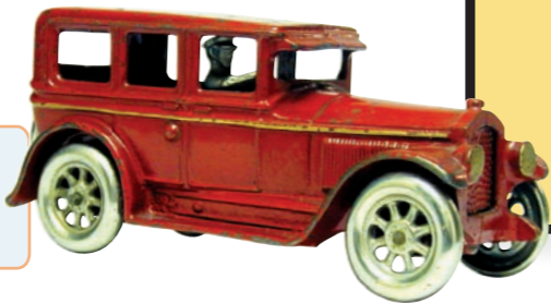
Room 7 This Buick sedan, by Arcade Manufacturing Co., is made of cast iron.