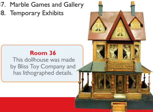
Room 36 This dollhouse was made by Bliss Toy Company and has lithographed details.